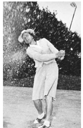
"Babe Didrikson Zaharias."

Babe Didrikson Zaharias was a remarkable American athlete who excelled in track and field, basketball, and golf. Born on June 26, 1911, in Port Arthur, Texas, she gained fame in the 1932 Olympics, winning two gold medals and one silver. She later turned to golf, becoming a founding member of the Ladies Professional Golf Association (LPGA) and winning 10 major championships. Known for her fierce competitiveness and exceptional talent, Zaharias was a trailblazer for women in sports, inspiring athletes worldwide.